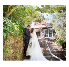
Utopia @ Waterfall Gully

- signings, elopements, ceremonies and receptions